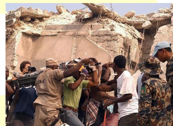
Rescue efforts in Haiti

brothers and sisters in Haiti. We are currently working on providing that support. In the meantime, we are encouraging all members of the Association to make a donation using the many charitable organizations involved in this disaster's relief.